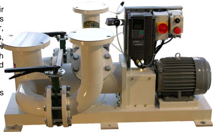
6" PRODUCTION UNIT (Model 62)

THE ADVANTAGE: Using a patented process to transmit multiple vibrating frequencies through existing pipe work, the TEI Fluidizer applies shearing action to particles at the fluidizing surface where it is most effective. Other mechanical devices used to clean silos can be difficult to install and require a two-man crew for safe operations. The TEI Fluidizer connects to the outside of a storage unit and requires no entry.