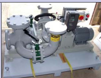
6" Trial Unit

Not all powders, operations or air slide systems are the same. To learn more about whether a TEI Fluidizer demonstration makes sense at your facility, please call us. (630) 879-0297.